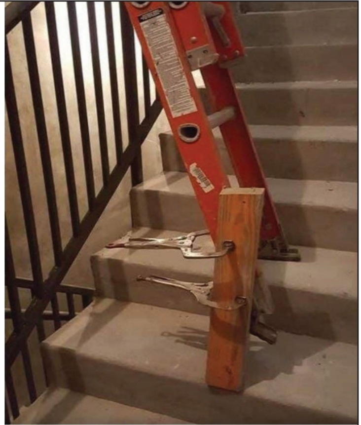
It is ladder safety month after all...